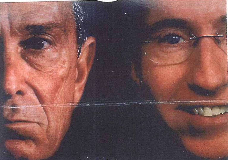
NYC Mayor Michael Bloomberg